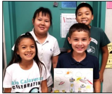
AR Board winners