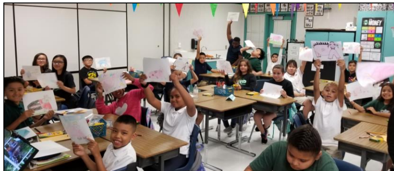
Showing off our drawings during art time.