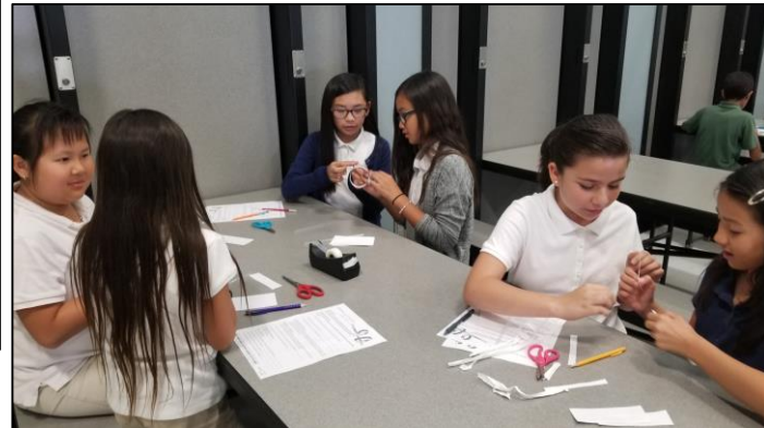
Making hoop gliders.

There are a lot more pictures on our class website.