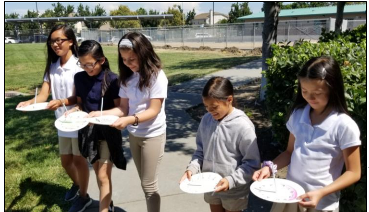
Testing out Sundials for a STEM project