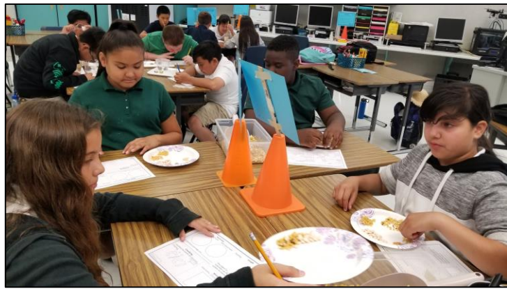
Science tools investigations